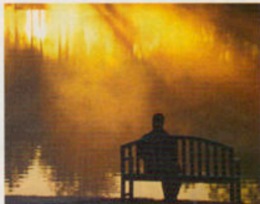
A visitor spends a contemplative moment at Haley Farm near Clinton.