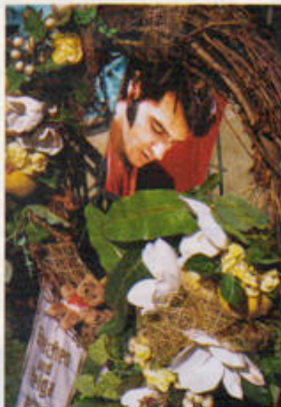
left: At Graceland, fans honor Elvis. below: Smokey is the Tennessee Vols' biggest fan. below, right: Colorful roadside bounty pops up all over the state.

28 It's Easy Being Green A list of our public gardens resembles (but, rest assured, never showcases) kudzu—it just goes on and on. Take in the botanicals in Chattanooga, Clarksville, Cookeville, Harrogate, Jackson, Knoxville, Martin, Memphis,