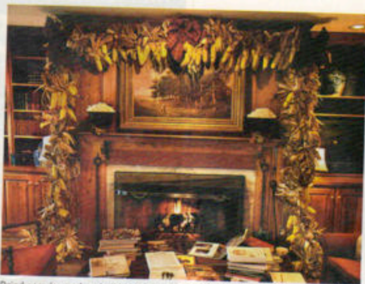
Dried corn is used as holiday garland. "The decorations need to be items that historically could have been used for Christmas," says James.

No one disputes James's personal contributions to achieve perfection. Each evening, when the crew departs for a well-deserved night's rest, he typically keeps toiling until 5 a.m. or so, then he goes to bed and sleeps until noon.