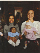
Proud mothers display their proof that Scalini's eggplant parmigiana worked for them. These children are lifetime members of the Second Generation Club.