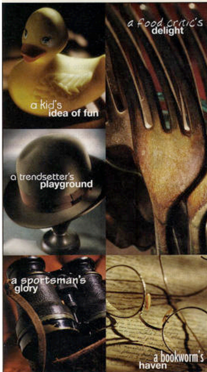
a food critic's delight