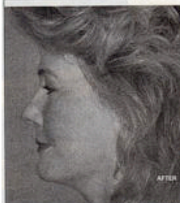
Actual Patient Photo

*Accreditation Association for Ambulatory Health Care, Inc.