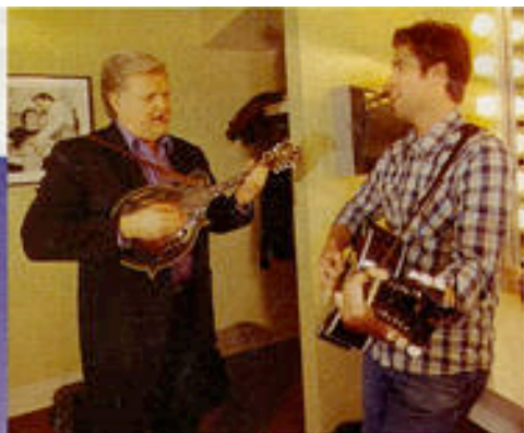
left: Revered by musicians and music fans alike, the Ryman Auditorium is one of the most historic venues in the country. above: Bluegrass legend Ricky Skaggs (left) plays with up-and-comer Josh Turner backstage at the Ryman.